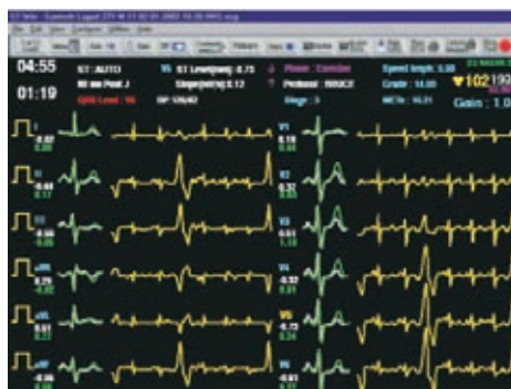
12 Lead mode with Superimposed Medians